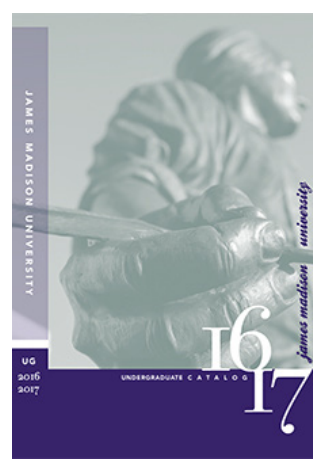
Academic Policy and Curriculum Development